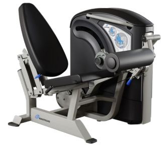
LEG EXTENSION S6LE