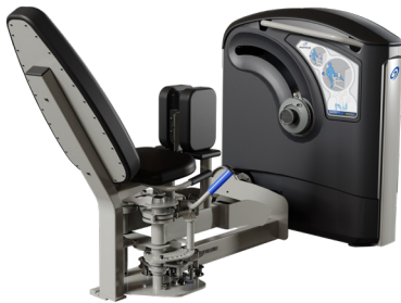
HIP ABDUCTION/ADDUCTION S6AA