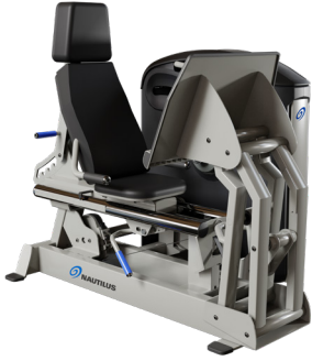
LEG PRESS S6LP