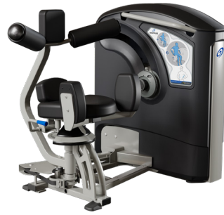
ROTARY TORSO S6RT