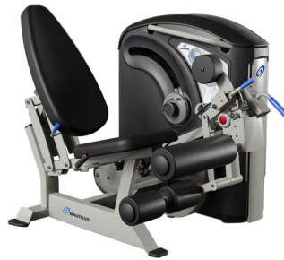
SEATED LEG CURL S6LC