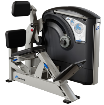
LOW BACK S6LB