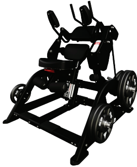
ABDOMINAL CRUNCH 9NP-L5003