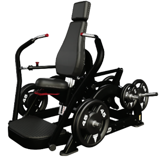
CHEST PRESS 9NP-L2002