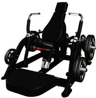
DECLINE PRESS 9NP-L2004