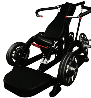
INCLINE PRESS 9NP-L2003