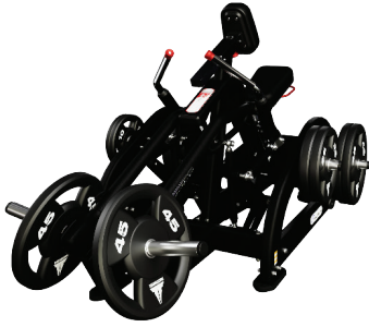
LOW ROW 9NP-L3004