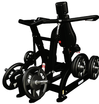
SHOULDER PRESS 9NP-L4002