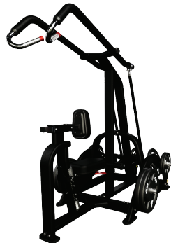
HIGH ROW 9NP-L3005