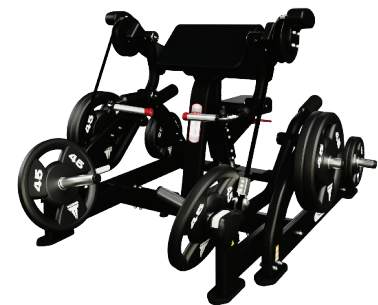
BICEPS CURL 9NP-L5002