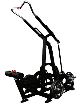
LAT PULL DOWN 9NP-L3003